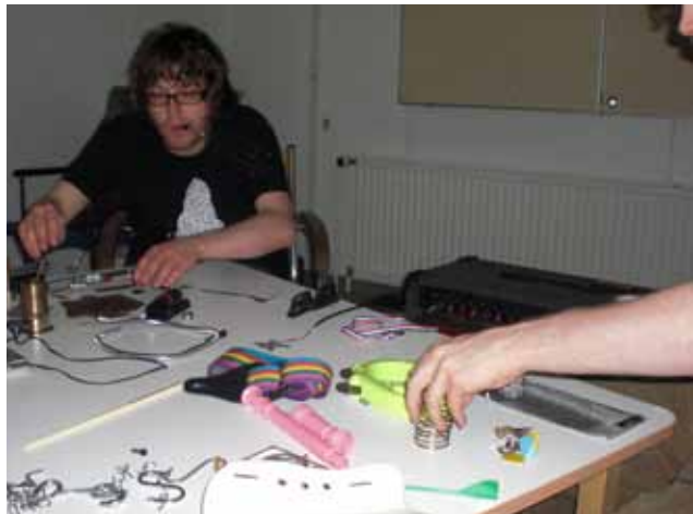
Team Usurper Workshop 5 May 2010