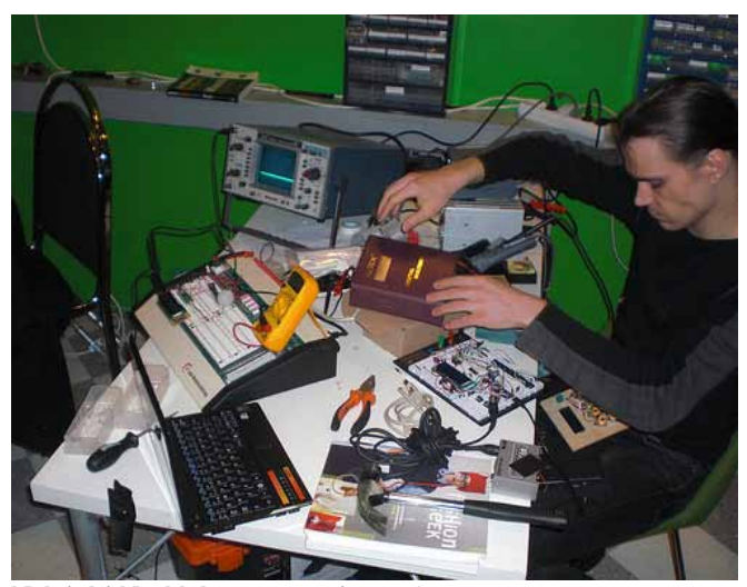
Helsinki Hacklab open projects day 30 March 2010