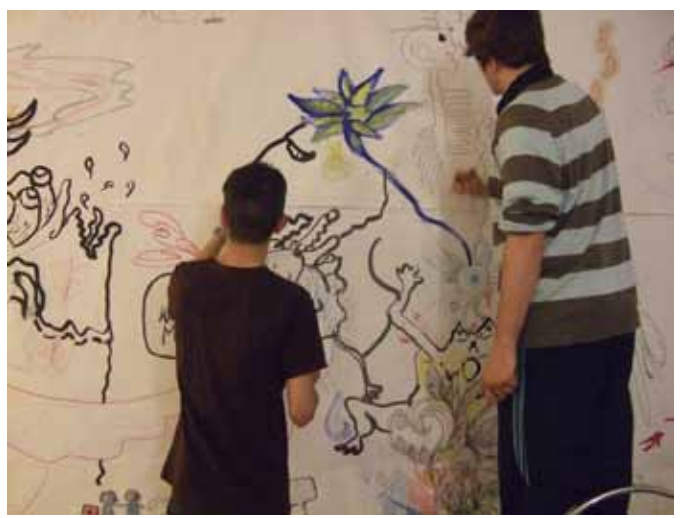
Drawing! marathon 23 April 2010