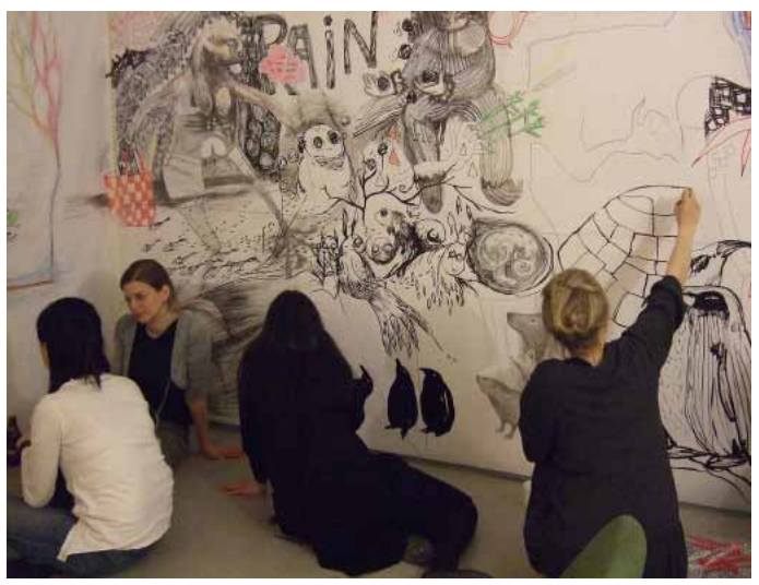
Drawing! meeting #2 23 April 2010