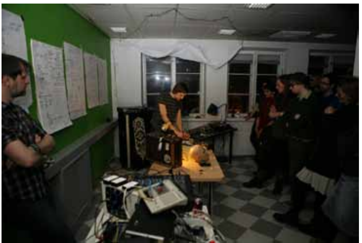
Neanderthal Electronics concert/presentation