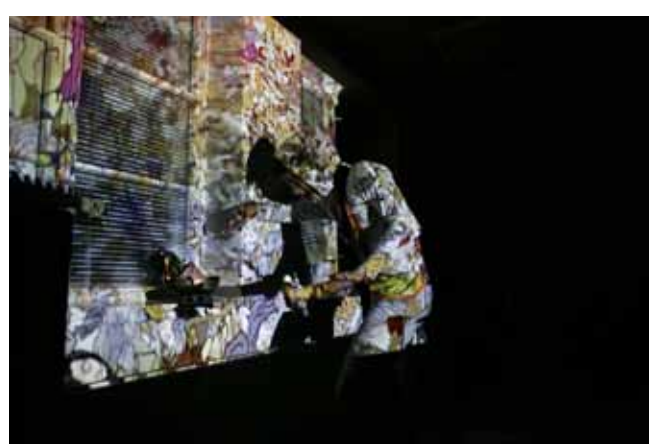
Cartune Xprez / Hooliganship 11 November 2009