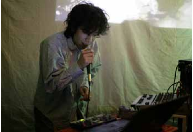
Oorutaichi 2 December 2009

performance) w/Lamprey and Vinegar, Kutomo