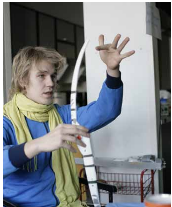
Art and Sustainability workshop 22 January 2010