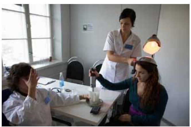
PALFUCON 25 September 2010

Ptarmigan has also been used as a meeting space for many of our affiliated projects, such as Mental Alaska and the Public School Helsinki. The Helsinki Hacklab group originally met in Ptarmigan and held several Open Days here before formalising their organisation and getting a space of their own (which is just upstairs from us).