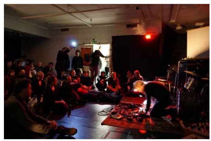
Tomutonttu 9 January 2010