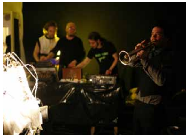
Invalid Robot Factory + Koelse 28 March 2010