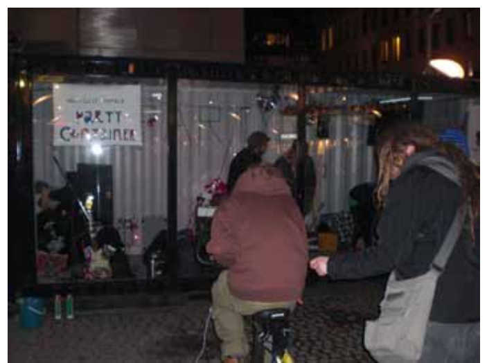
Self-sustainable party container, Pixelache festival 24 March 2010

In January, Pixelache sponsored a workshop at Ptarmigan called 'Art and Sustianability'. This workshop was led by Taavet Jansen and Maike Lond from Estonia, and it brought together a group of local artists who later participated in the Pixelache festival. During the two day workshop, participants experimented with mechanical and electronic methods to construct energygenerating devices. The results were exhibited at the festival in the form of a ''self-sustainable party container'', placed in front of Kiasma, where windmills and exercise bikes generated the electricity needed for a party.