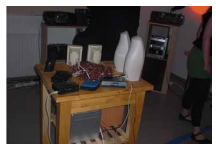
Satakieli by Roope Eronen 25 May - 2 June 2010