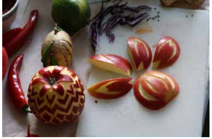
Sculptural Food Workshop 24 April 2010

The Svamp project (originally based in Suomenlinna) relocated to Ptarmigan in 2010. Svamp is intended to be a regular meeting point for improvising musicians and non-musicians as well. These meetings are open to the public and encourage new ways of group improvisation, looking at games, exercises and other ideas. In January, Argentinian sound legend Alan Courtis led a one-day workshop on improvisation and musique concrete. In May, the Usurper artists (from Edinburgh, Scotland) offered a workshop on deconstructing broken musical instruments to create new ones.