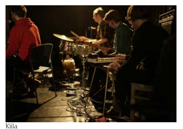
12 February 2010