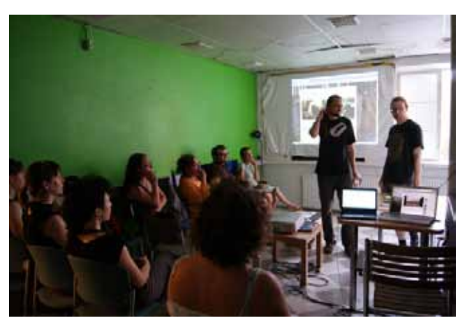
Clip Kino: Forest 2.0 28 July 2010