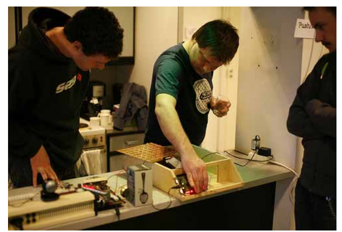
Helsinki Hacklab open projects day 28 February 2010