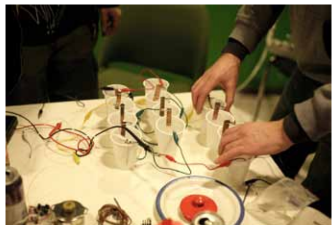
Art and Sustainability workshop 23 January 2010