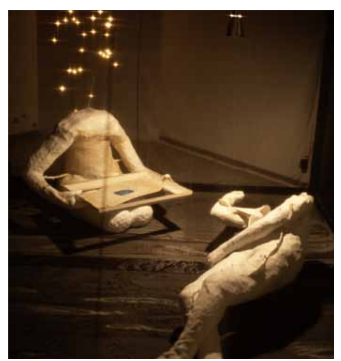
Fagment #6 by Cathérine Kuebel 11-23 June 2010