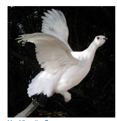
Idea Liberation Zone sunnuntai 7 huhtikuuta 2013 19:00 presentations : creative exchange : criticism